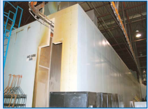
AUTOMATED JETTING SYSTEMS OF CANADA DRY OFF & BAKE OVEN