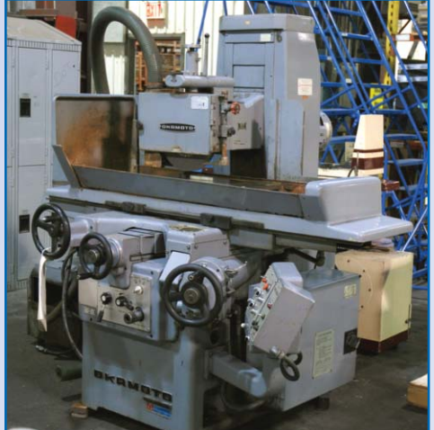
OKAMOTO 12"X24" SURFACE GRINDER