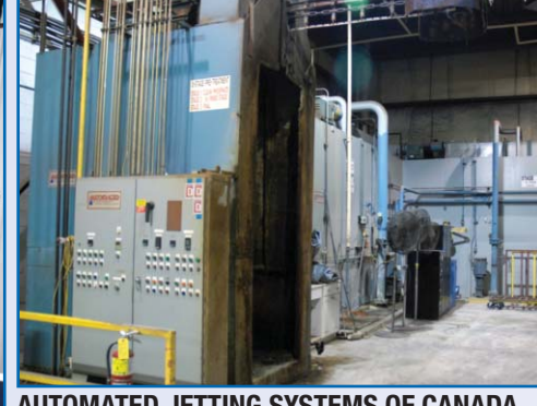
AUTOMATED JETTING SYSTEMS OF CANADA 3 STAGE PRE-TREATMENT

AUCTIONEER'S NOTE: Line May Be Sold 2 Ways, As A Bulk Lot And Individually