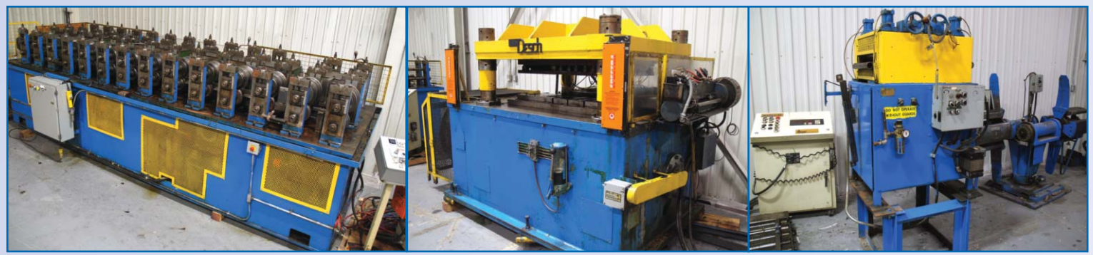
VIEW OF ECONOWAY ROLLING LTD 14 STAND ROLLFORMER MODEL ECO 266, DESCH 100 TON, 4 POST TRIM PRESS, FEEDER & CONTROLS (TOOLING EXCLUDED)