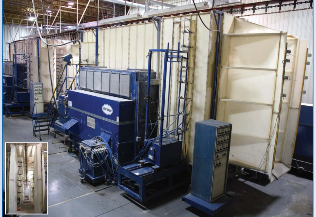
(2) COMPLETE NORDSON ELECTROSTATIC POWDER COATING SYSTEMS