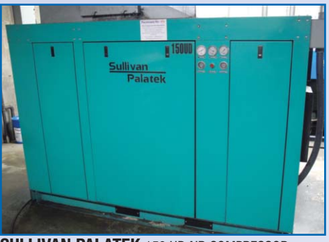
SULLIVAN PALATEK 150 HP AIR COMPRESSOR