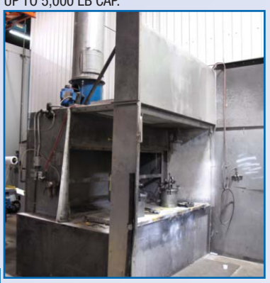
BINKS SAMES PAINT / SANDING BOOTH