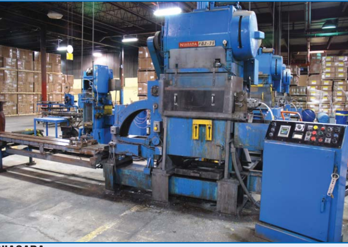
NIAGARA PD2-35, 35 TON PRESS