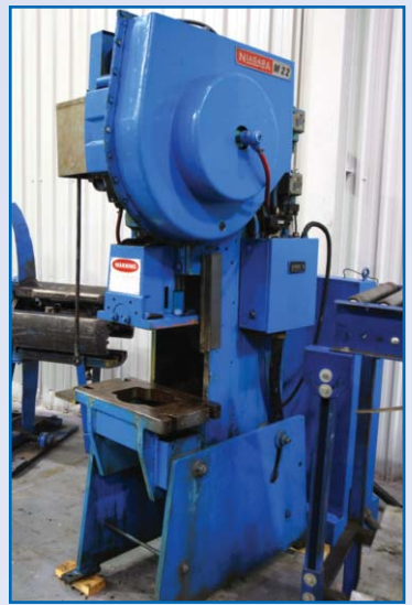
NIAGARA MODEL M22, 22 TON OBI PRESS