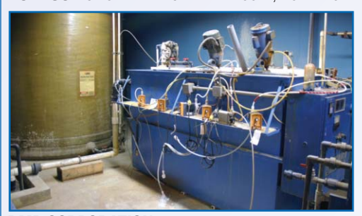
DMP CORPORATION WASTE WATER TREATMENT SYSTEM