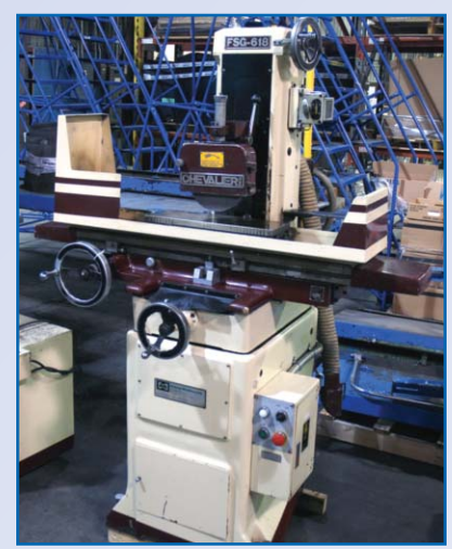
CHEVALIER 6"X18" SURFACE GRINDER