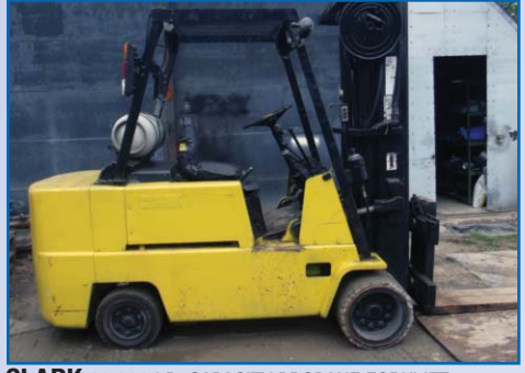
CLARK 12.000 LB. CAPACITY PROPANE FORKLIFT