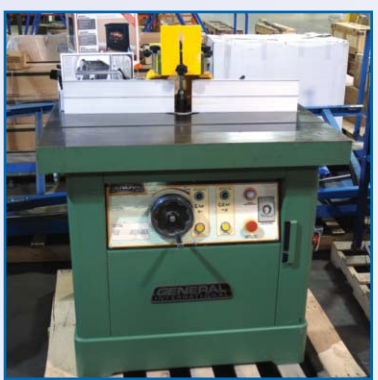
GENERAL 1-1/4" WOOD SPINDLE SHAPER MODEL 40-450

This brochure is meant merely as a guide. Infinity Asset Solutions makes no guarantee, expressed or implied, as to the accuracy of the information in this brochure. Buyers should inspect the goods beforehand to satisfy themselves.