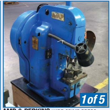
AMP & PERKINS WIRE CRIMP PRESS