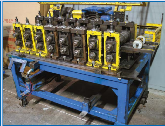
8 STAND ROLLFORMER (TOOLING EXCLUDED)